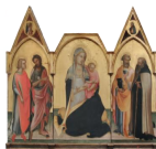
4. Madonna of humility